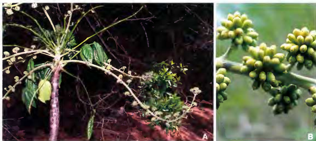
Fig. 2.— Polyscias mayottensis : A, branch with inflorescence and young leaves (Labat & Pascal 2928); B, nearly mature fruits (Pascal & Labat 778).

in several remnant stands of both mesophyllous forest and dry forest, which along with humid forest comprise the three primary vegetation types present on the island. The new species is most frequently encountered in mesophyllous forest, a transition formation that is thought to have originally occupied most of the western slope and the southern third of Mayotte, but is now restricted to three small stands: Mt. Hachiroungou in the northwest, Sohoa in the west, and Dapani in the foothills of Choungui in the south. Together these areas cover less than 2% of the total surface of the island (PASCAL 1997). Polyscias mayottensis is relatively abundant in this vegetation type, especially on the steep slopes of Mt. Hachiroungou between ca. 400 and 500 m, where the relatively low, irregular canopy reaches about 15 m in height. The new species also occurs on the Sohoa plateau, which averages about 200 m altitude, where the forest has a more closed canopy. In both areas, P. mayottensis occurs with Gastonia duplicata , as well as several other characteristic species, including Grisolea myrianthea Baill., Trophis montana (Leandri) C.C. Berg, Tannodia cordifolia Baill., Strychnos mitis S. Moore, and Ravensara areolata Kosterm. Polyscias mayottensis has not been observed at Dapani (although it could be expec-